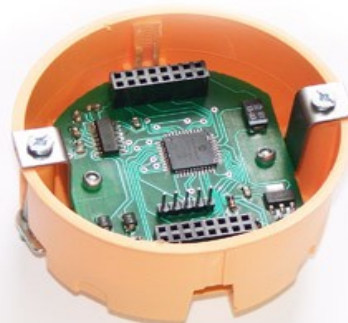
Plasterboard wall box 60mm (accessory)