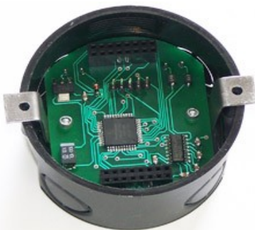
Wall concealed box 60mm (accessory)